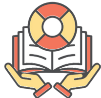
A Literacy Lifeline

Begin delivery of Little Libraries in partner facilities