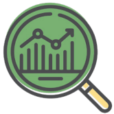
A Learning Laboratory

Begin digital content creation for parents