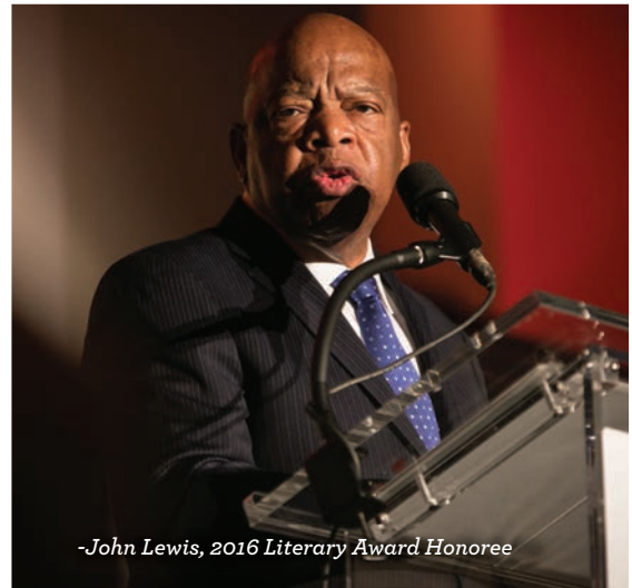
-John Lewis, 2016 Literary Award Honoree